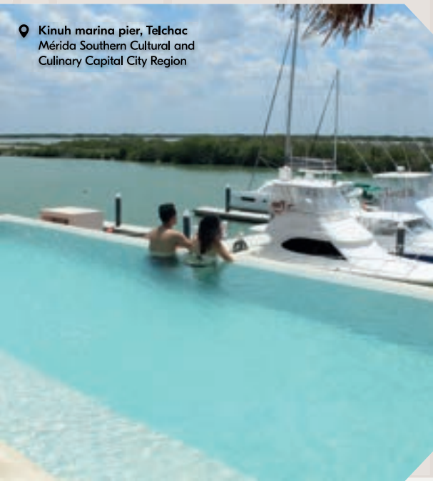
Kinuh marina pier, Telchac Mérida Southern Cultural and Culinary Capital City Region