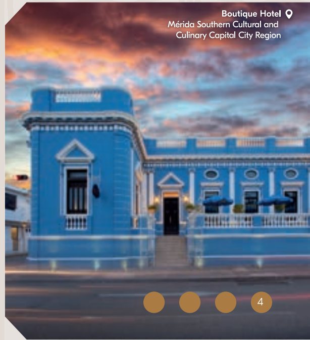
Boutique Hotel Mérida Southern Cultural and Culinary Capital City Region