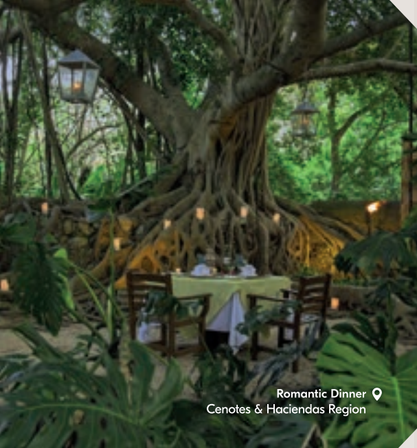
Romantic Dinner Cenotes & Haciendas Region