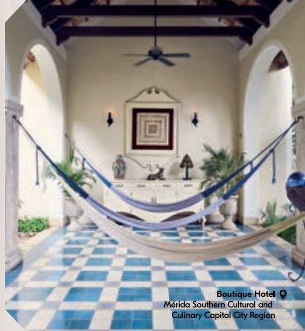
Boutique Hotel Mérida Southern Cultural and Culinary Capital City Region