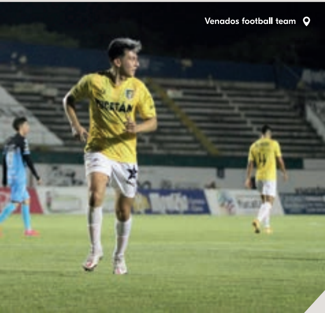
Venados football team

Thanks to its geographic location, its excellent climate conditions, the sporting infrastructure, and the existing highways, there are a lot of activities which can be performed in Yucatán: baseball, soccer, sport fishing, triathlon, hiking, diving and cave diving, golf, box, cycling, swimming, windsurf, kitesurf, charrería , horse riding, among many other activities.